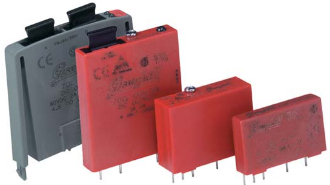
70L-ODC5R 70G-ODCR/OACRLY 70-ODCR/OACRLY 70M-ODCR